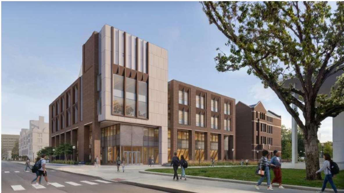
Figure A: View of South Elevation (facing Ross Business School)

Exterior materials proposed for the addition are limestone and brick (to match the existing Lorch Hall structure), with glazing for significant natural daylight.