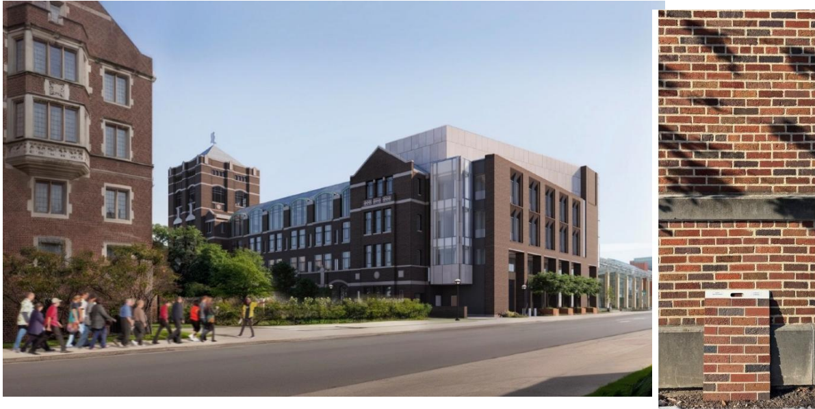
Figure B: View of West (Tappan) and North Elevation

The brick sample board shown in the photograph on the right shows that the color, texture, and mortar of the addition will closely match the existing Lorch Hall brick.