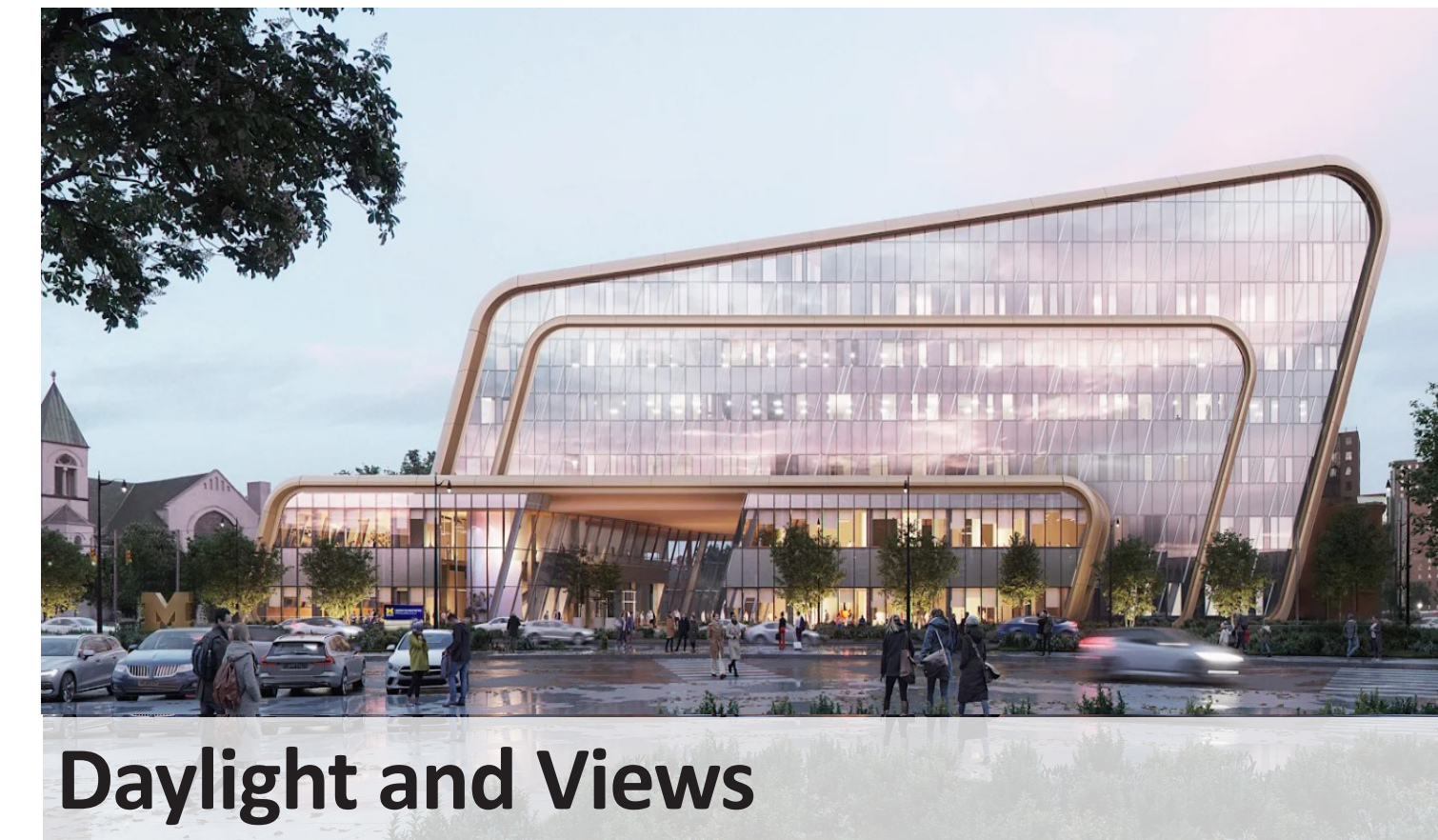
Daylight and Views

The UMCI design prioritizes access to quality views and daylight for regularly occupied interior spaces, with 46% of spaces with daylight autonomy and 90% of spaces with quality views.